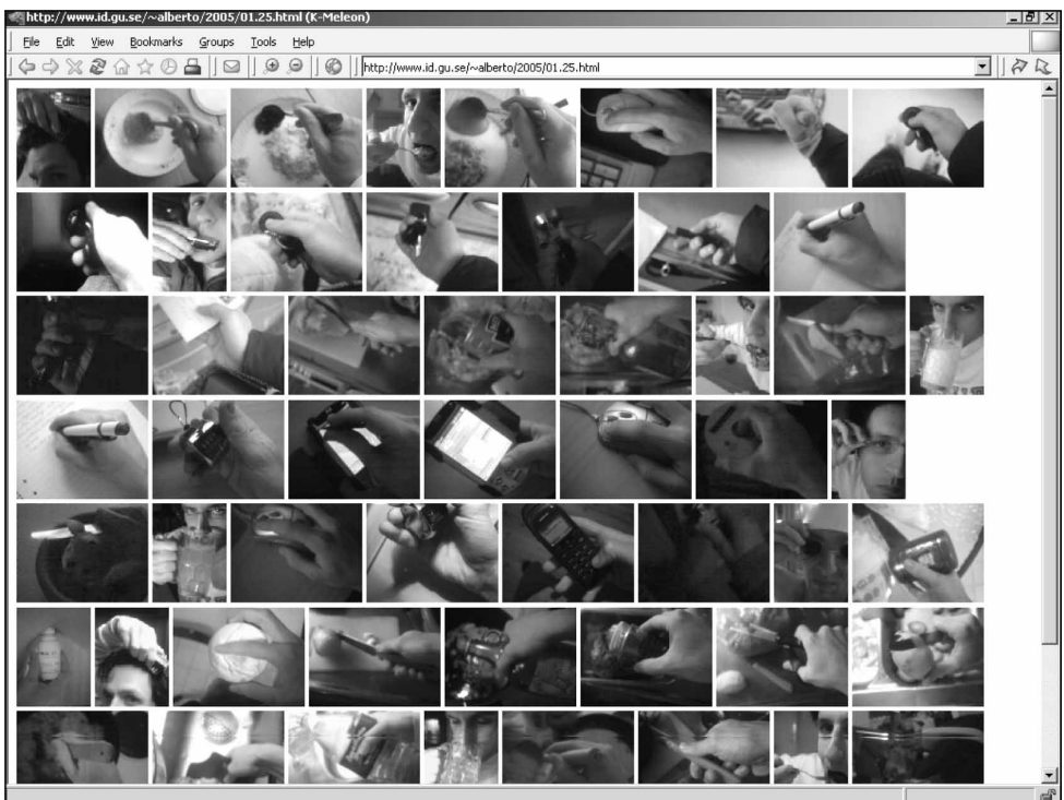
Figure 3. A small part of Alberto Frigo’s autobiography project, a manually produced partial ‘life-log’ of all his interactions with everyday objects.